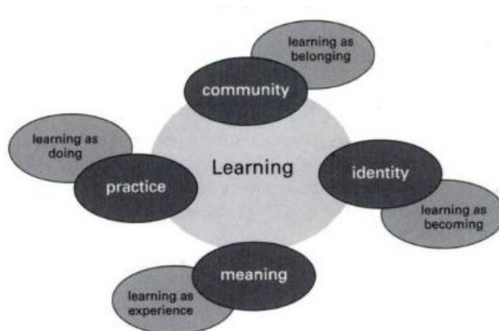
Figure 1. Learning as a change in situated practice [24].

and technology in an integrative manner to carry out some sort of social action to attain a personal or shared goal ('learning as doing'). Thus, both language and media education should be taught in context. As Wegner [24] puts forward when he defines learning as a change in situated practice, learning is not about the acquisition of a code (linguistic or digital) but about knowing which resources one needs to use to take part in socially-situated actions. Practice (action) contextualises learning ('learning as experience') and it is through the process of knowledge construction that the use of (verbal and visual) language and the exercise of cognition generate learning. Participation in goal-oriented tasks is not possible if participants do not adopt discursive identities (language experts/non-experts; inquirer/respondent, etc.) and roles (actor; director; script writer, etc.) while they conduct the tasks at stake ('learning as becoming'). Through practice, participants also construct the social (and cultural) knowledge embedded in the actions taken, which underscores them as members of a given community of practice ('learning as belonging'). Figure 1 below illustrates this conceptual learning model: